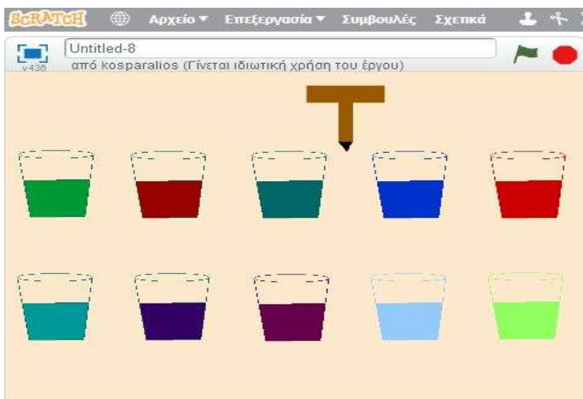
Figure 3: Scratch software to measure the pH of the substance contained in the glasses, Assessment Activity